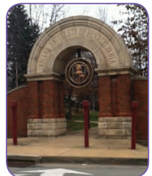
Our Future My Choice Medical Clinic of Indiana!