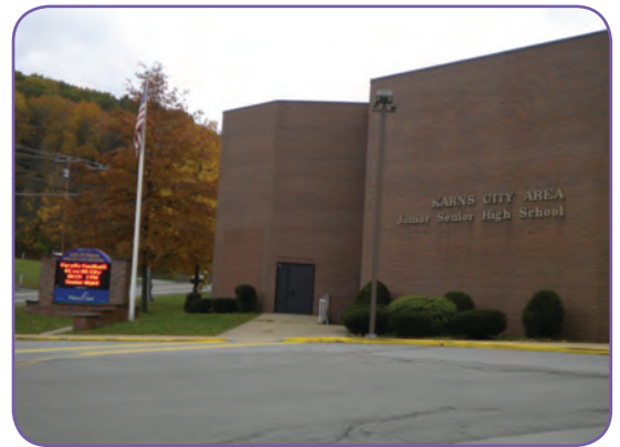
Karns City Jr-Sr High School

Hope for the future. That's what our programs offer teens.